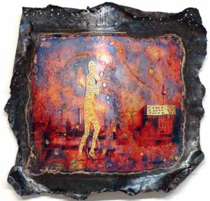
Sven Hoffmann "Molecular Men" Photography on steel sheet 117 x 120 cm 2010 / 2013