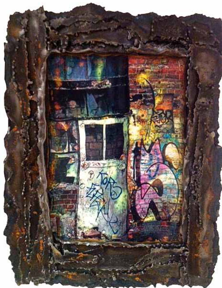
Sven Hoffmann "Factory No. 5" Photography on steel sheet 45 x 58 cm 2012 / 2013