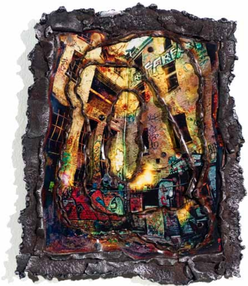
Sven Hoffmann "Factory No. 9" Photography on steel sheet 24 x 29 cm 2012 / 2014