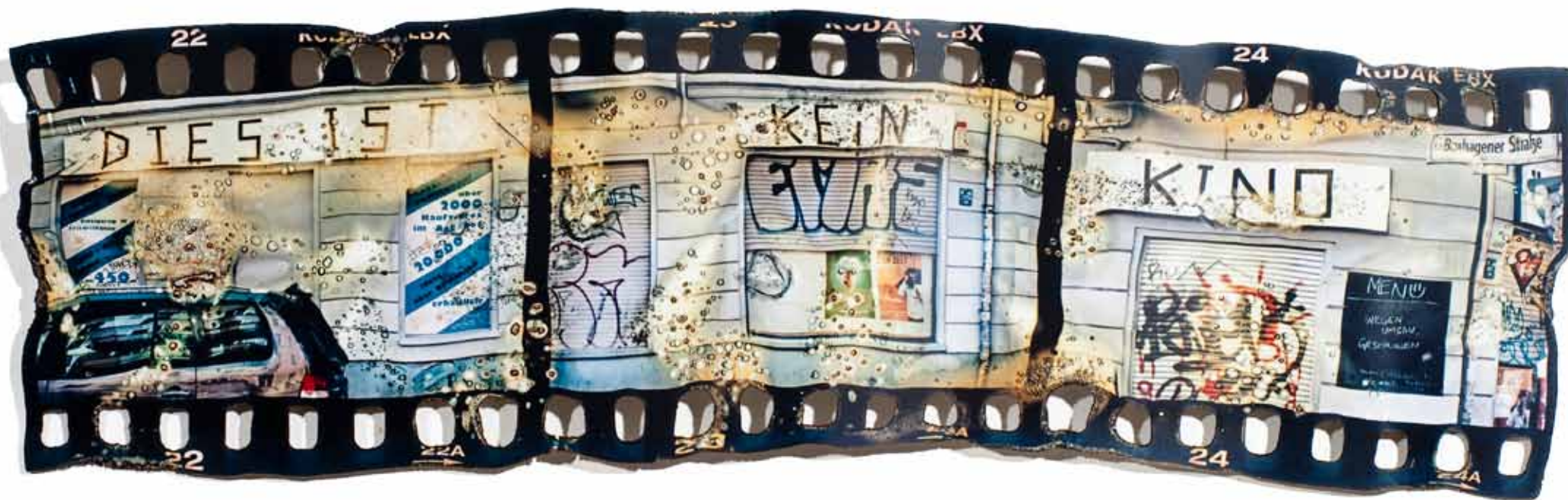
Sven Hoffmann "This is not a Movie" Photography on Aluminium 40 x 130 cm 2013