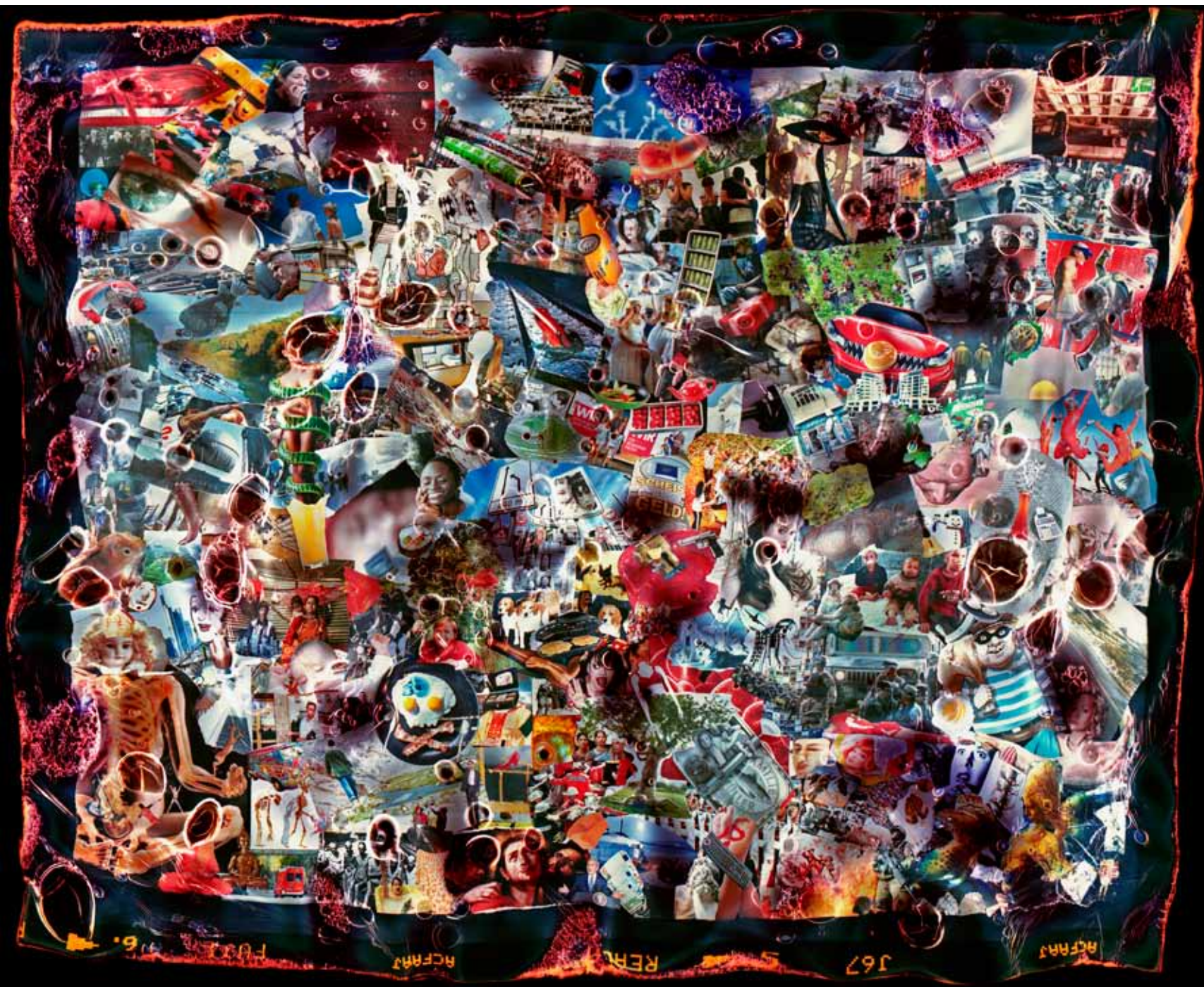
Sven Hoffmann "Thoughtways" Photography on Aluminium 80 x 95 cm 2013 / 2014