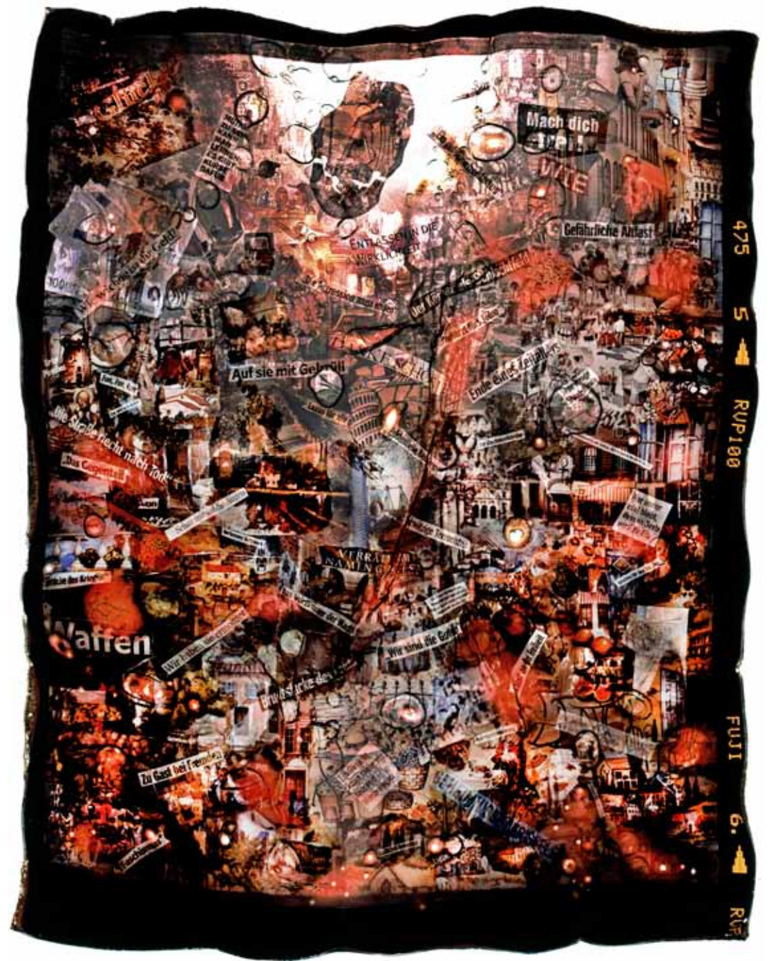
Sven Hoffmann "Much ado about Nothing" Photography on Aluminium 99 x 118 cm 2013 / 2014