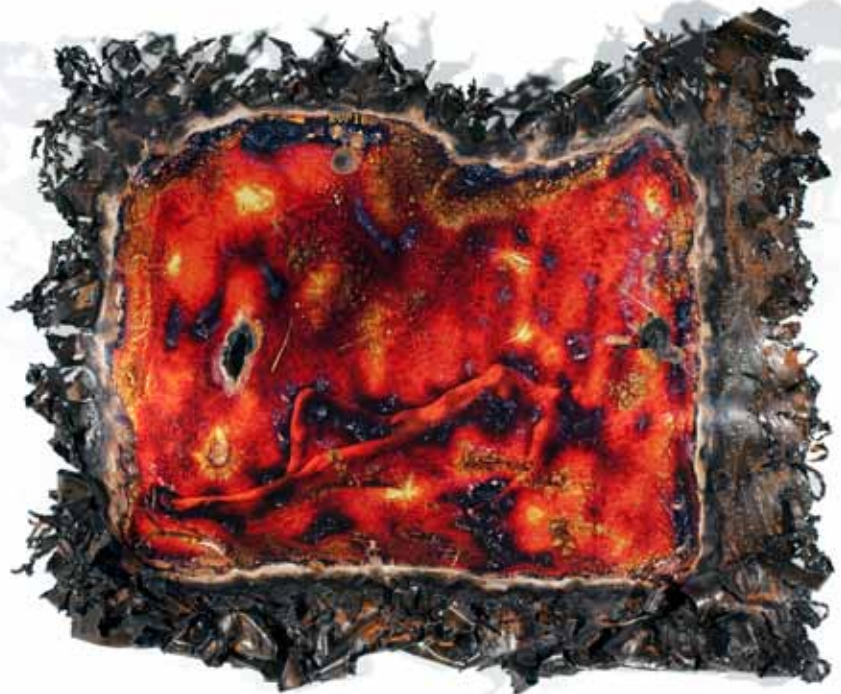
Sven Hoffmann "Passion" Photography on steel sheet 122 x 144 cm 2007 / 2013