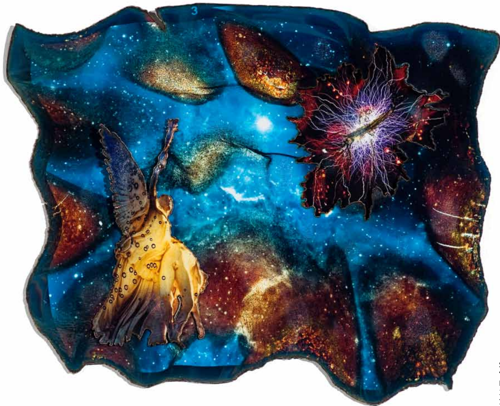
Sven Hoffmann "The Transition" Burn Art, 3D 30 x 37 cm 2013 / 2014