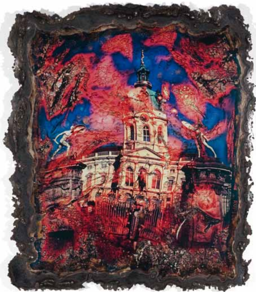
Sven Hoffmann "Charlottenburg Palace" Metal 86 x 96 cm 2010 / 2013